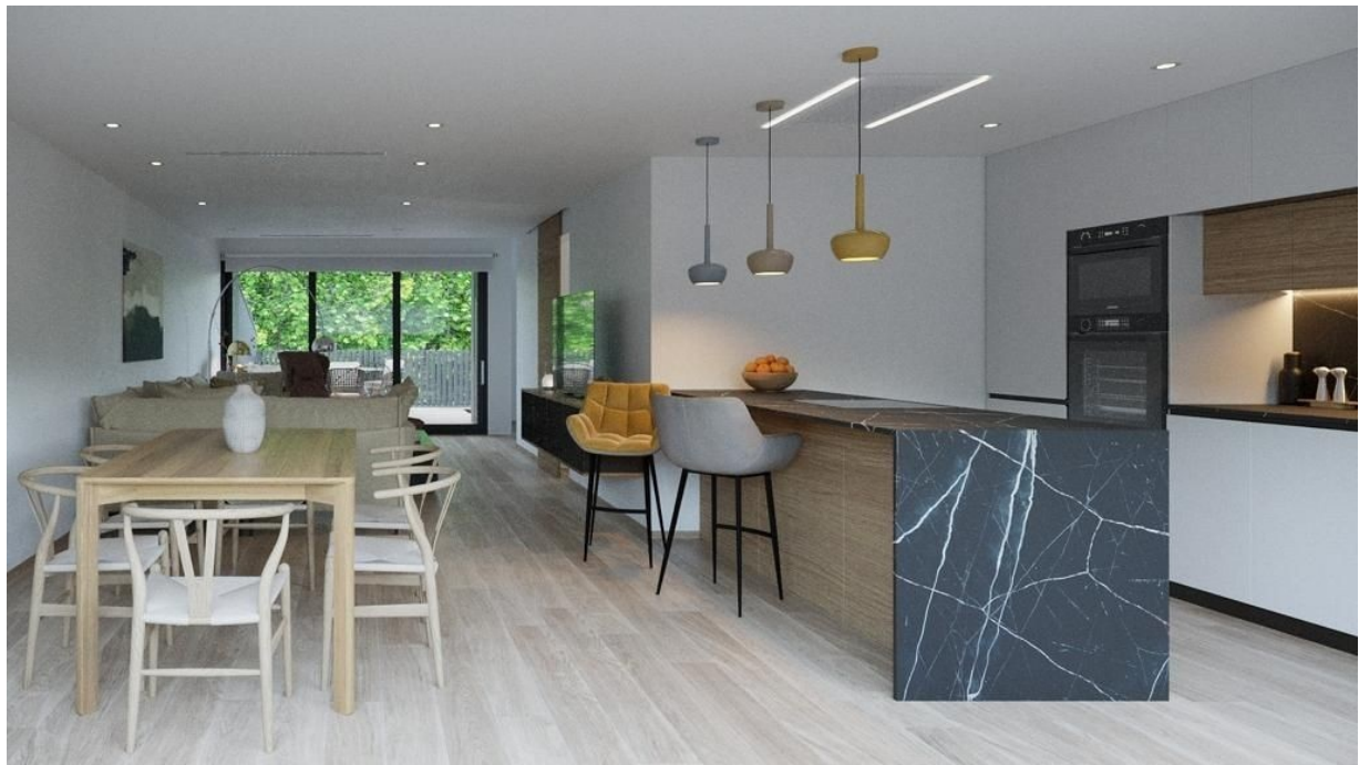
Kitchen with dining area design